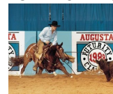
SMART LITTLE KITTY