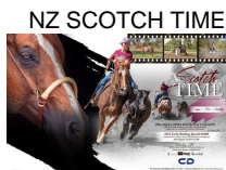
NZ SCOTCH TIME