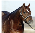
HIGH BROW CAT