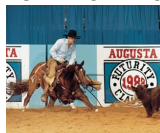
HIGH BROW HICKORY