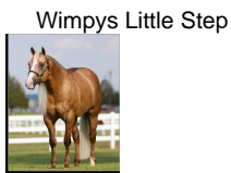
Wimpys Little Step