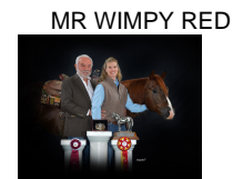
MR WIMPY RED