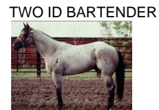
TWO ID BARTENDER