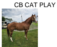
CB CAT PLAY