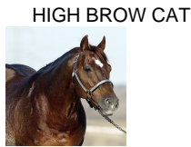
HIGH BROW CAT