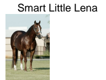
Smart Little Lena