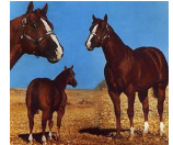
WATCH JO MOORE