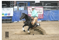
JOES GOTTA SHINER