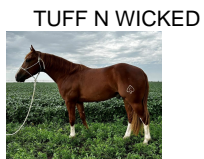
TUFF N WICKED